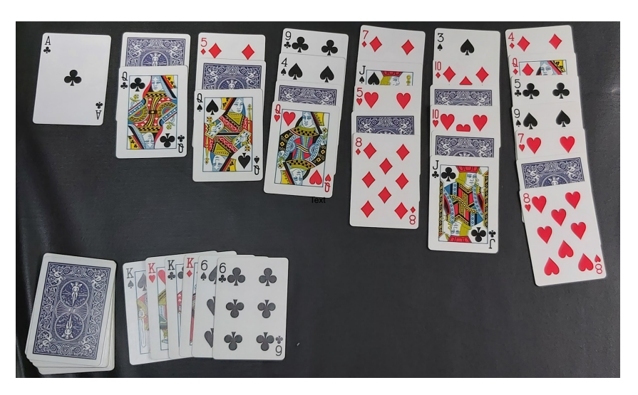
Figure 2 Handcrafted complex layout that our model proves unwinnable. All cards in the tableau except the fully visible ones should be face-down but are shown here to explain the impossibility. Cards which are not explicitly shown are unnecessary to prove unwinnability.

can be moved though they can be tableau-built on. The full proof is provided in Appendix B; here we sketch the proof and link it to the five rules.